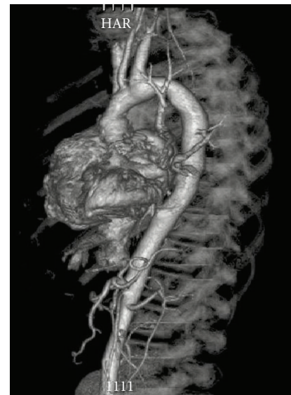
FIGURE 3: Postoperative CT angiography.

The prognosis of patients with SVAS is related to the severity of aortic stenosis which, in turn, influences the age of presentation [3]: accordingly, a 30-year survival is predictable in only 12% of pediatric patients with severe SVAS. Structural changes of the coronary vessels, either