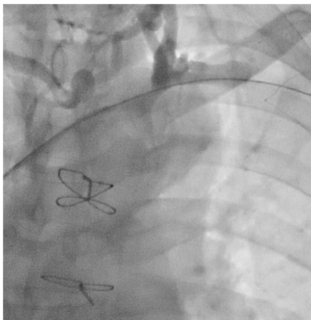
Figure 1 After successful wiring with a 0.35 in Terumo guidewire, venogram confirmed the site of stenosis at the junction of the left subclavian vein and left innominate vein.

The 0.035 in hydrophilic guidewire and 0.018 in guidewire from the micropuncture set failed to pass antegradely from left subclavian and axillary venous access. Contrast injection through the 7 French SafeSheath confirmed that the puncture site was within the true lumen. The site of