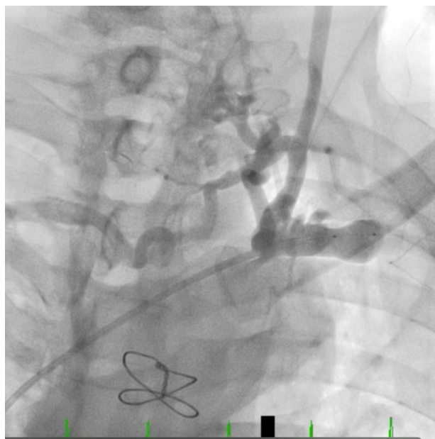
Figure 3 Venogram after venoplasty reviewed well-developed collaterals at the junction between the left subclavian vein and left innominate vein, suggesting the stenosis was chronic.

innominate stenosis was finally identified retrogradely from the femoral venous approach with a coronary guiding catheter. Although an extravascular was necessary, retrograde guidance not only allowed us to delineate the left innominate venous anatomy, it also allowed strong support for venoplasty. By placing the coronary guiding catheter just proximal to the stenotic site and placing the Grandslam guidewire down the left brachial vein, a very strong backup support was gained to pass the peripheral balloon through the stenotic site.