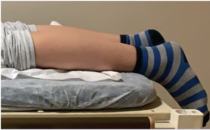
FIGURE 1. The position of the patient on the examination table while performing ultrasound measurements.