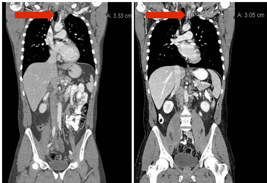
Fig. 2. CT scan pretreatment and at 4 weeks demonstrating enlargement of a supraclavicular node (red arrow).