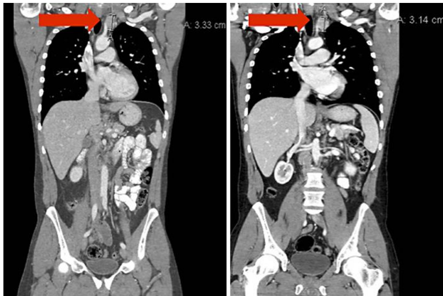
Fig. 4. CT scan at 4 weeks and at 8 weeks demonstrating shrinkage of the supraclavicular node (red arrow), indicative of pseudoprogression.

Carter et al.: Immune Reactivity and Pseudoprogression or Tumor Flare in a Serially Biopsied Neuroendocrine Patient Treated with the Epigenetic Agent RRx-001