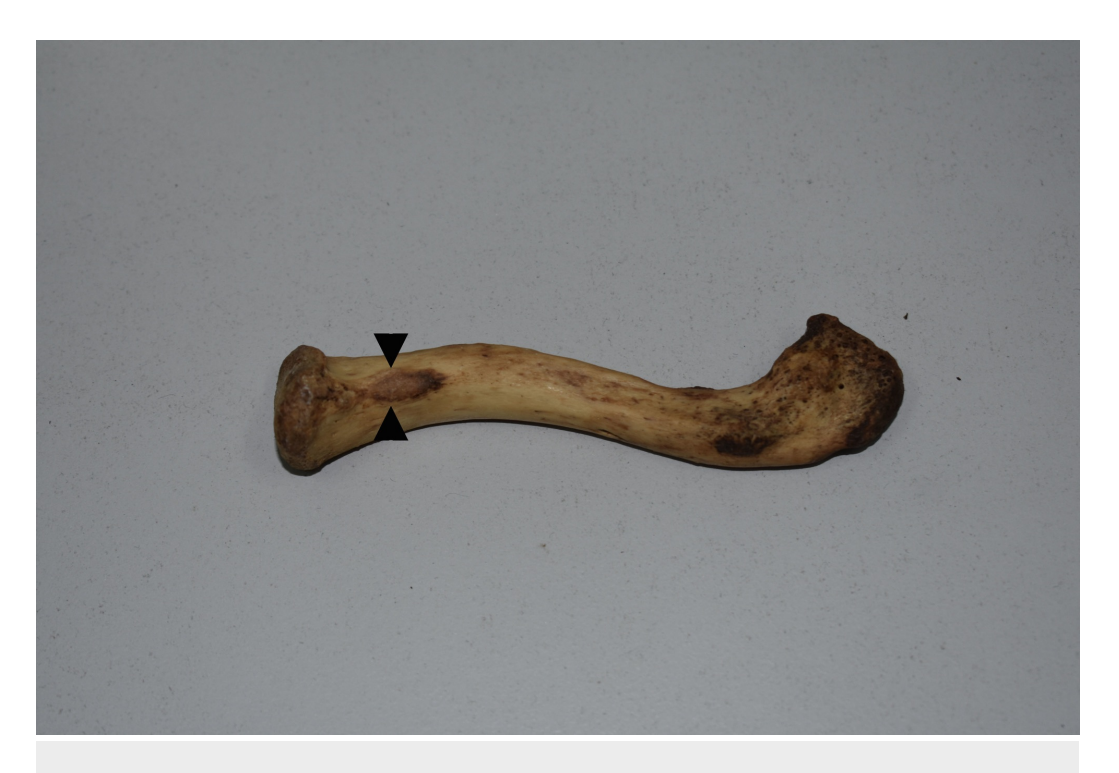
FIGURE 2: Apophysis of the impression for the costoclavicular ligament on a left clavicle.

The oval-shaped faceted apophysis (arrow heads) of the impression for the costoclavicular ligament, as seen on the inferior aspect of the sternal end of a left clavicle.