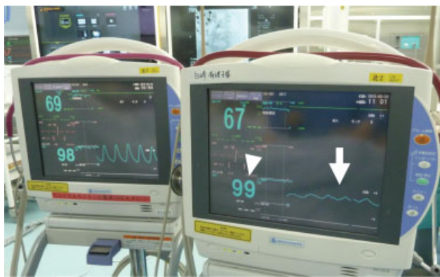
Fig. 2 Pulse oximeter waveform. Pulse oximetry waveforms after a temporary blockage of the flow of one common iliac artery. The display on the left shows a normal pulse oximetry waveform and right shows a low amplitude waveform (arrow), indicating poor leg perfusion. Note that SpO 2 measurements are kept at 99% (arrowhead). (Reproduced with permission from Eiji Kondoh, Ikuo Konishi. Perinatal Medicine (Tokyo). (Japanese). Tokyo Igakusha. 2015;45:1131–1135).