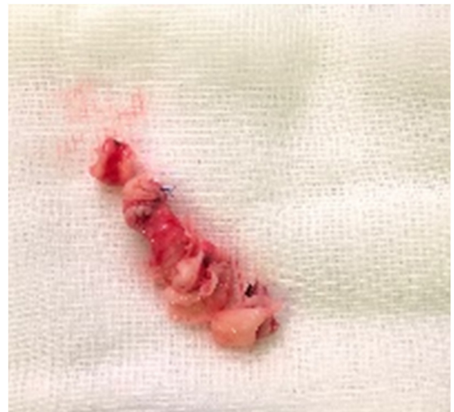
Fig. 2. The luminal dissection of the iliac artery.

Six hours after the surgery, urine output was 1.6 L. Hematocrit was at 40%, serum sodium concentration was 128 mmol/L, potassium was 4.4 mmol/L. Tacrolimus (FK), mycophenolic acid (MMF) and steroids were used to prevent graft rejection. Doppler ultra-