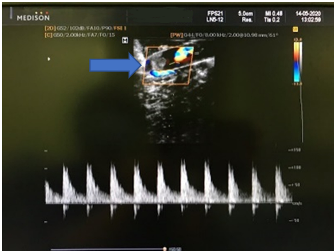
Fig. 1. Thrombus (arrow) in the transplanted renal artery.

were normal, including glucose and blood lipids (serum glucose 5.23 mmol/l, triglyceride 2.8 mmol/l, and cholesterol 5485 mmol/l). Pre-operative Doppler ultrasound (US) and computed tomography (CT) scan did not show any sign of atherosclerosis. He was made to put in the transplant waiting list after passing a thorough evaluation based on the Vietnam Ministry of Health's conditions. The donor was a 47-year-old brain-dead female donor after a traffic collision. The operation plan was to be replaced the recipient's right kidney by the donor's one.