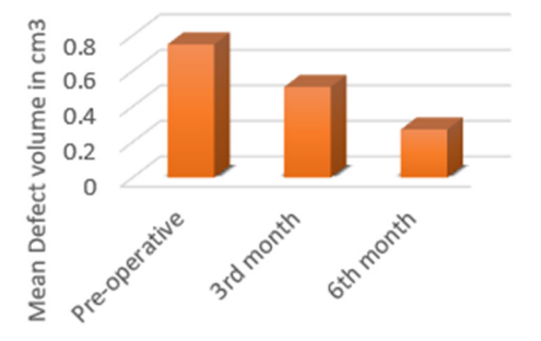
Fig. 3. Alveolar cleft defect volume in cm<sup>3</sup>.

counter measure against bone resorption following secondary bone graft in the long term. Eriko et al. [10] proved the reduction of bone resorption by the application of platelet-rich plasma (PRP) in bone grafting of the alveolar cleft. They also emphasized that PRP was effective in preserving the width and height of the graft than autogenous cancellous bone graft alone. MPM is totally autologous and thus devoid of risks of infection and rejection when used along with bone grafting [4]. It is a cost-effective source of growth factors and is an easy and effective alternative to be considered for the treatment of alveolar clefts.