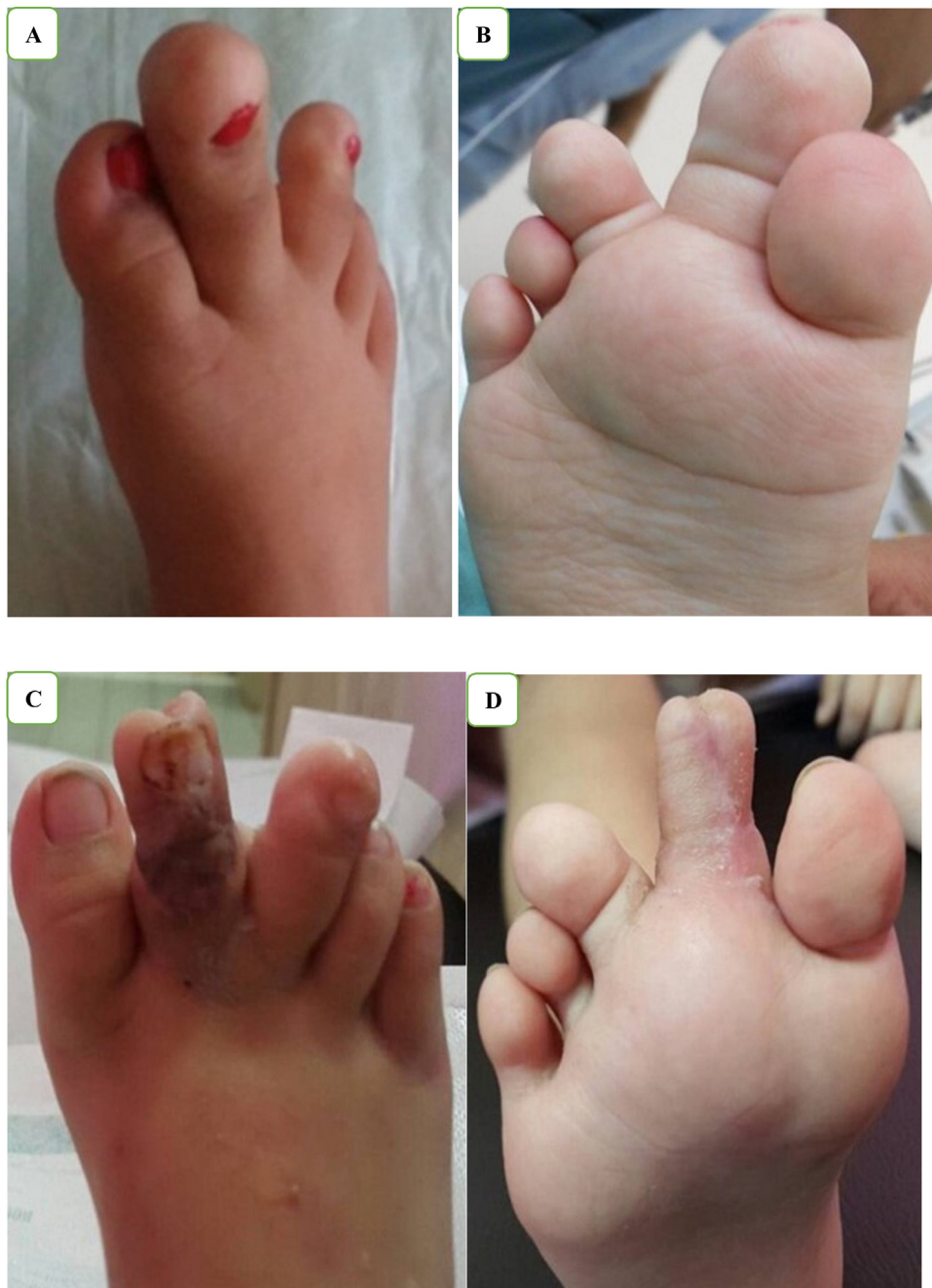
Fig. 5. A. Dorsal view of the patient's foot before the surgery. B. Plantar view of the patient's foot before the surgery. C. Dorsal view of the patient's foot two months after the second surgery. D. Plantar view of the patient's foot two months after the second surgery.