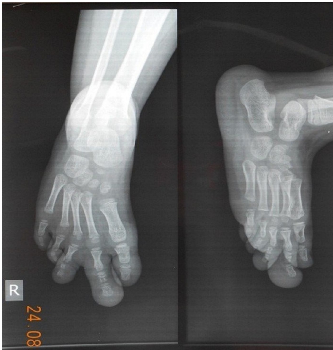
Fig. 2. X-ray imaging before the surgery.

[1,2,5]. This case of macrodactyly was considered nonhereditary, consistent with the patient's family history, as no family member had the same condition [6].