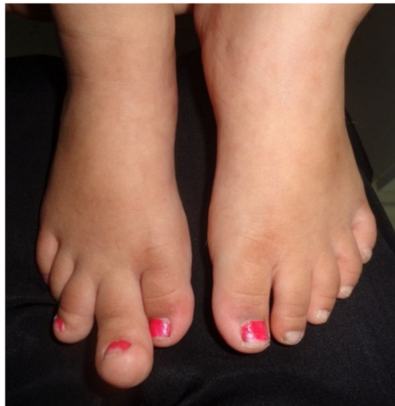
Fig. 1. Picture of the patient's foot before the surgery.