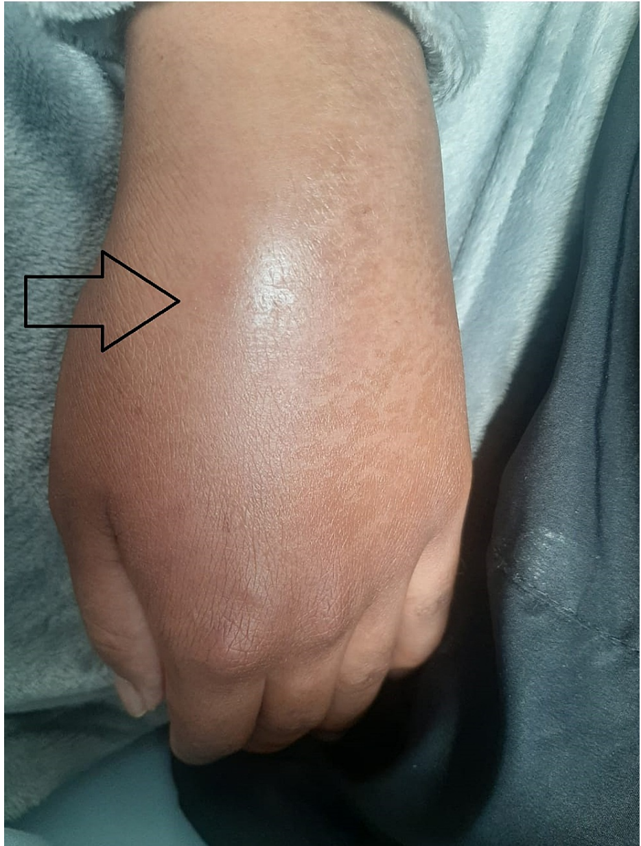
FIGURE 1: Left carpal synovitis