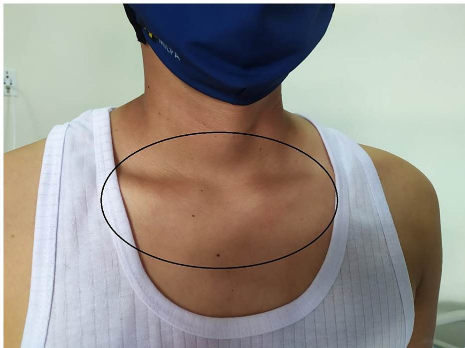
FIGURE 3: Sternoclavicular joint synovitis

Magnetic resonance imaging of the different compromised anatomical compartments was performed, presenting as additional findings the presence of bursitis of the lateral collateral ligament of the left lower limb and a peritendinous inflammatory process of the triangular fibrocartilage in the right wrist. Mild lymphopenia associated with a marked elevation of acute-phase reactants was documented in laboratory studies. Differential diagnoses of infectious etiology were sought, including a positive fourth-generation HIV enzyme-linked immunosorbent assay with a subsequent CD4 count of 98 cells/mm 3 and a viral load of 459,000 copies/mL. Treatment with prednisolone at a dose of 1 mg/kg and sulfasalazine (1 g per day) was initiated and no significant improvement in joint symptoms was noted despite sequential changes from disease-modifying antirheumatic drugs (DMARDs) such as methotrexate and leflunomide. Subsequently, the