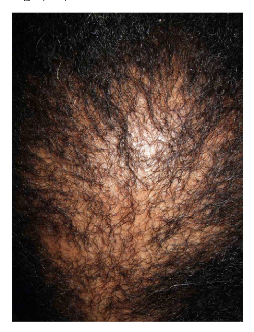
Fig. 13. CCCA in an African American woman.

correlation between chemical relaxer and hot comb use, seborrheic dermatitis, or bacterial infections (Olsen et al., 2011).