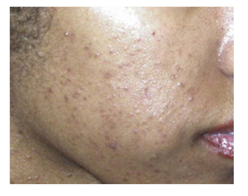
Fig. 1. Acne in an African American female (Courtesy of Susan C. Taylor, MD, et al; from Treatments for Skin of Color , copyright Elsevier 2011).

correlated with acne in African American, Asian and Continental Indian women (Perkins et al., 2011). However, to date, results from studies evaluating potential differences in sebaceous gland activity and size and sebum production between racial groups remain contradictory. Additional factors such as genetics, diet, cosmetics, tobacco, stress, medications, and hormonal influences from estrogens and androgens also play a role in adult women with acne (Davis and Callender, 2010; Fisk et al., 2014).