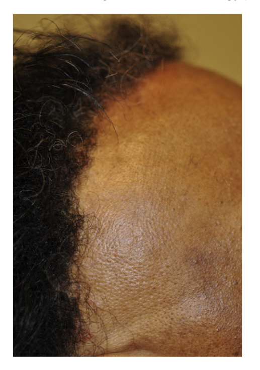
Fig. 15. FFA in an African American female. Note the symmetrical band-like loss of hair on the frontotemporal hairline and scalp. (Courtesy of Valerie Callender, MD; Callender Dermatology & Cosmetic Center, Glenn Dale, MD).

An interesting clinical finding of FFA is termed the "lonely hair sign" (Tosti et al., 2011). There has been debate as to whether this sign is specific to FFA, as it is common to see hairs that are spared from the inflammatory processes in all types of cicatricial alopecias (Camacho, 2012). However, it is important to note that this term describes the presence of one or few isolated terminal hairs, particularly in the middle of the forehead; as FFA is the only cicatricial alopecia characterized by progressive recession of the frontotemporal hairline (Tosti, 2012). Another useful tool in the diagnosis of FFA is dermoscopy (Inui et al.,