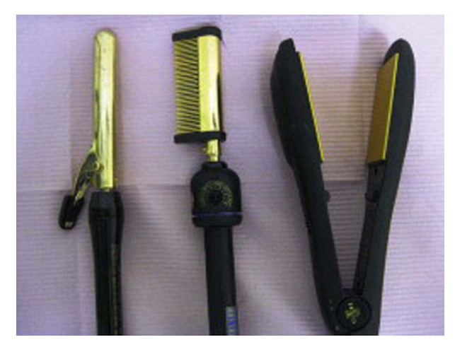
Fig. 7. (Left to right) Electric curling iron, hot comb and ceramic flat iron (Courtesy of Valerie Callender, MD; from Treatments for Skin of Color by Susan C. Taylor, MD, et al, copyright Elsevier 2011).

As the early stage of TA is reversible, it is very important that the public be educated on the increased risk of TA in patients with symptomatic traction an combined hairstyles, such as the tight braiding of relaxed hair. It has been suggested that to influence the practice of at