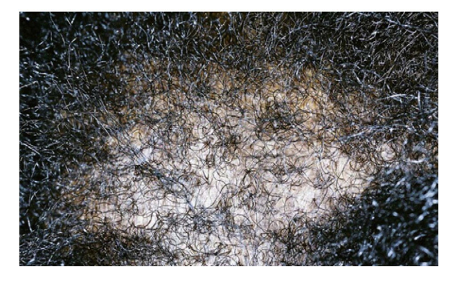
Fig. 12. CCCA (Courtesy of Susan C. Taylor, MD, et al; from Treatments for Skin of Color , copyright Elsevier 2011).

In terms of associated disorders and hair grooming practices, results of a cross-sectional survey by Kyei et al found a statistically significant correlation with type 2 diabetes mellitus, bacterial skin infections and hairstyles like braids and weaves. Interestingly, no significant difference was noted in the use of chemical relaxers and hot combs. There was also a strong positive correlation between the age of the subjects and degree of hair loss (Kyei et al., 2011). A study by Olsen et al found no significant