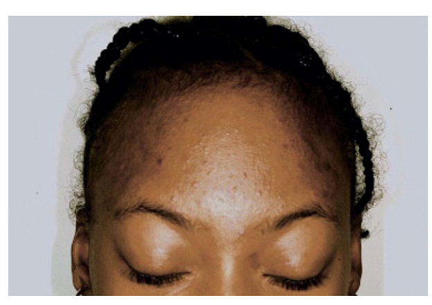
Fig. 3. Pomade acne. Note the closed comedones on the forehead and temples.

Women of color with acne may also develop distinctive subtypes of acne secondary to unique cultural practices integral to their ethnic background. Pomade acne, commonly seen in African Americans, presents as closed comedones and papules along the frontal hairline, forehead, and temples (Davis and Callender, 2010; Yin and McMichael, 2014) (Fig. 3). Pomade acne occurs secondary to long-term daily use of oils and thick emollients used for moisturizing ethnic hair. Acne cosmetica is also frequently encountered among women of color and presents as comedones due to the use of certain cosmetic products that are used to conceal acne lesions and PIH (Davis and Callender, 2010; Yin and McMichael, 2014). In addition, steroid acne may be seen in patients using skin-lightening agents that contain potent topical corticosteroids in efforts to improve PIH (Callender, 2004).