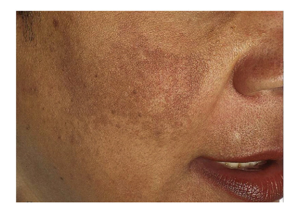
Fig. 5. Melasma, malar variant.

Other combination creams have also been studied and show promising results. In a randomized study conducted by Lim, 40 Chinese female subjects were treated with 2% kojic acid in a gel containing 10% glycolic acid and 2% hydroquinone (Lim, 1999). The gel was applied to one-half of the face twice daily and compared with a gel containing only 10% glycolic acid and 2% hydroquinone applied to the other half of the face twice daily for 12 weeks. The authors found that in 60% of the subjects in the kojic acid group, more than 50% of melasma lesions had cleared versus 47.5% of subjects in the 10% glycolic acid and 2% hydroquinone group (Lim, 1999). More recently, a hydroquinone-free, multimodal complex skin lightening agent has been developed to address dyschromias such as melasma. This agent acts via targeting multiple pathways in melanin synthesis including reduction in melanocyte activation, melanin synthesis, melanin transfer to keratinocytes, and epidermal melanin (Makino et al., 2013). Grimes (2014) presented a case report of six female subjects with Fitzpatrick skin types IV - V with moderate epidermal facial melasma treated with a hydroquinone-free, multimodality skin brightener. Patients applied the agent twice daily and were evaluated at 4, 8, and 12 weeks. The Investigator Overall