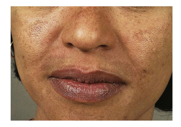
Fig. 6. Melasma, centrofacial variant with sparing of the philtrum.