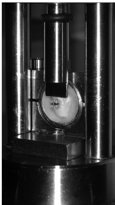
Figure 1 The universal testing machine with the specimen holder ring.

D'Agostino–Person test confirmed the normality of the distribution for the SBS, but the Levene test did not show the