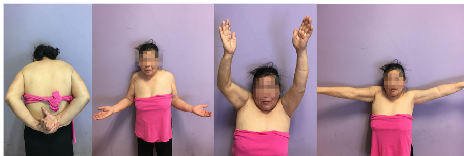
Fig. 2 At the 6-month follow-up, the patient had a good shoulder function. The 6-month constant score was 90

It was found that both NEER type II and III had favorable impact on intraoperative blood loss. In addition, Constant-Murley score, NEER score, length of operation and SF36 score were better in NEER type III patients of