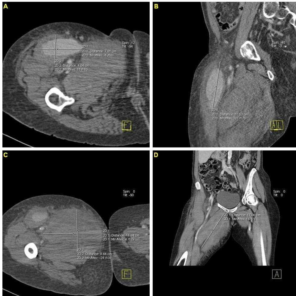
Fig. (1). Multislice computed tomography images demonstrating the pseudoaneurysms at the anterior (A, B) and internal (C, D) femoral regions.

operative course. A repeat computed tomography scan of the operated region showed no pathology and the patient was discharged a few days later with instructions for reassessment and rescheduling of the initial cardiac surgery.