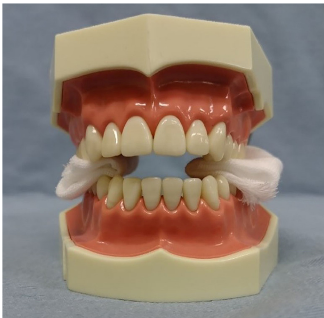
Figure 2 Splint with gauze (jaw model). In this case, a method similar to a pivot splint was used, in which the molars were raised mainly with gauze.

Splints used to treat temporomandibular disorders include stabilisation, repositioning and pivot splints. Stabilisation or pivot splints are used often for type IIIb temporomandibular