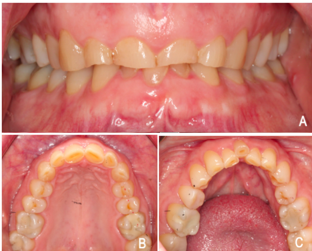
Fig. 2 Intra-oral photographs for a patient with anterior worn-down dentition due to protrusive bruxism habit. A: anterior retracted smile view, shows anterior teeth with short clinical crown and inconsistent gingival margins level, and posterior teeth with normal clinical height. B and C: Maxillary and mandibular occlusal view, shows signs of moderate to severe tooth wear on anterior teeth only.

Another type of challenging situation that requires a multidisciplinary approach involves short anterior clinical crowns due to a habit of anterior bruxism, combined with posterior teeth of normal height that maintain their vertical dimension (Fig. 2). In this type of situation, the anterior teeth will continue to erupt with the bone and surrounding tissue (compensatory eruption), thereby maintaining contact with the opposing teeth; this will result in short clinical crowns and