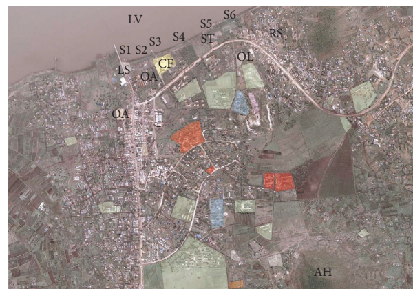
FIGURE 2: Satellite image showing the distribution of the sampling points [35]. *S: sampling sites, LS: landing site/Jetty, OA: open air market, CF: Capital fish factory, ST: sewage treatment plant, OL: old water treatment works, AH: Asego Hill, LV: Lake Victoria, and RS: residential sites.

from the surface of the water at a depth of about 50 cm from each of the sampling points. The sampling was carried out for a six-month period, from October 2011 to April 2012 with the period being dichotomised as rainy or dry season. Sampling months of October 2011, November 2011, and April 2012 were rainy months, while January, February, and March 2012 were all dry months. December 2012 was not included as a sampling month so as to balance the number of