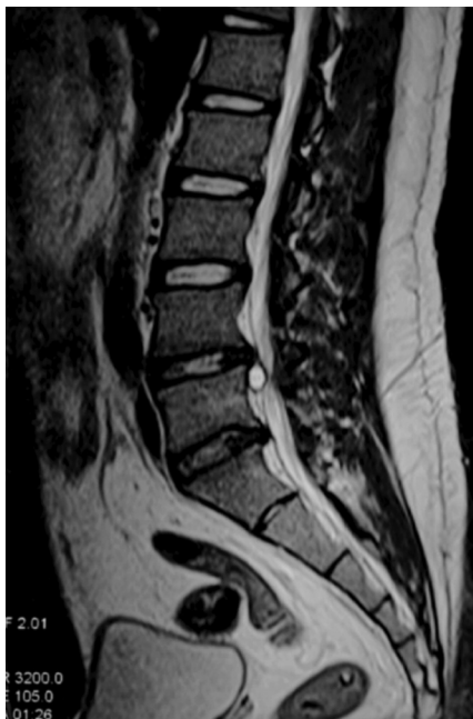
Fig. 1: Sagittal view of the lumbar spine MRI showing a cystic lesion in the anterior epidural space with high signal intensity on T2-weighted image.

kept flush with the lamina as medial as possible. With a 45-degree Kerrison rongeur and curette, the ligamentum flavum was incised and detached from the lamina to enable entry into the spinal canal. After the incision of ligamentum flavum and opening of the lamina, the traversing nerve root, thecal sac, and the discal cyst were clearly visualised. The discal cyst was found to be communicating with the L4/L5 intervertebral disc. It (Fig. 2) appeared faintly white in colour, containing serous fluid and was seen to be partially indenting the L5 nerve root. The cyst was excised at the base of the connection by performing an annulotomy. Histopathological examination showed fragment of cyst wall composed of fibrocartilaginous tissue devoid of epithelial lining.