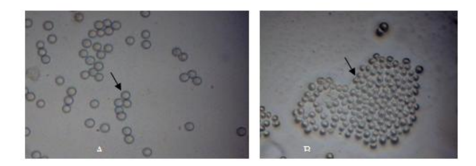
Fig. 1: (A) Light micrograph of Naegleria cysts in non-nutrient agar x400 (B) Light micrograph of Hartmannella vermiformis cysts in non-nutrient agar x400

Table 1: Location and distribution of Free- living Naegleria and Hartmannella in hot springs of Ardebilprovince, Iran