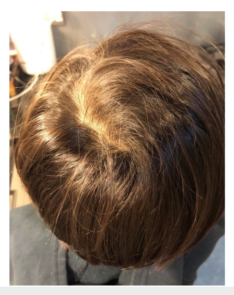
FIGURE 3: Patient hair regrowth five months following commencement of the diet and supplement regimen