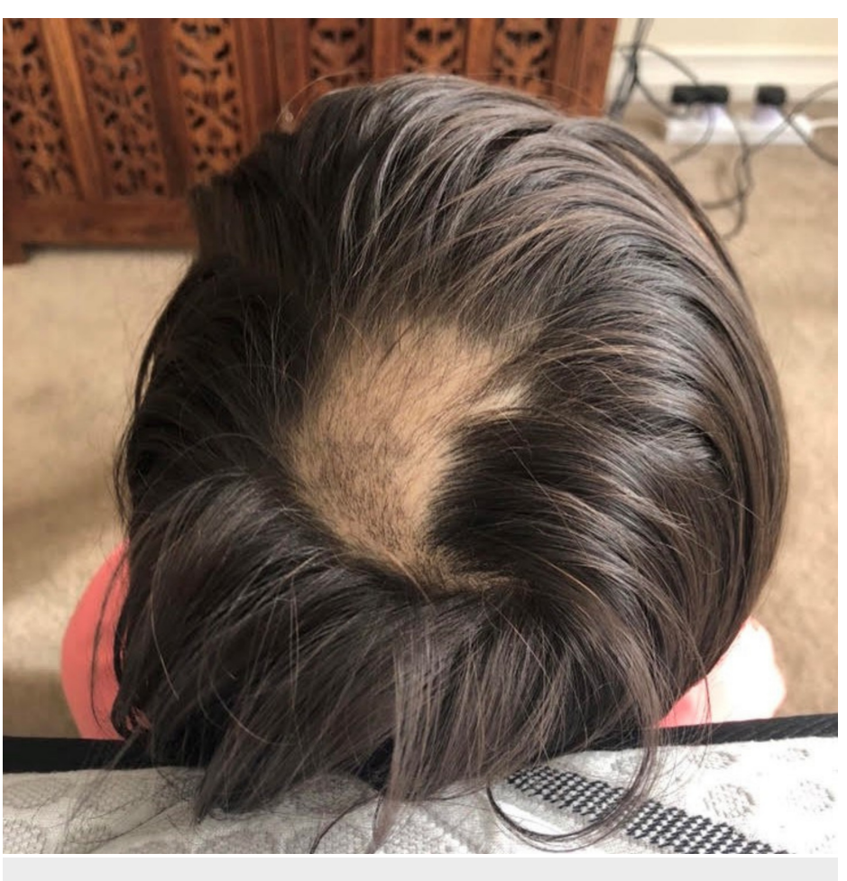
FIGURE 1: Spot baldness one week after the initial consultation

After following the prescribed dietary regimen for two months, the patient's hair can be seen to be regrowing in Figure 2.