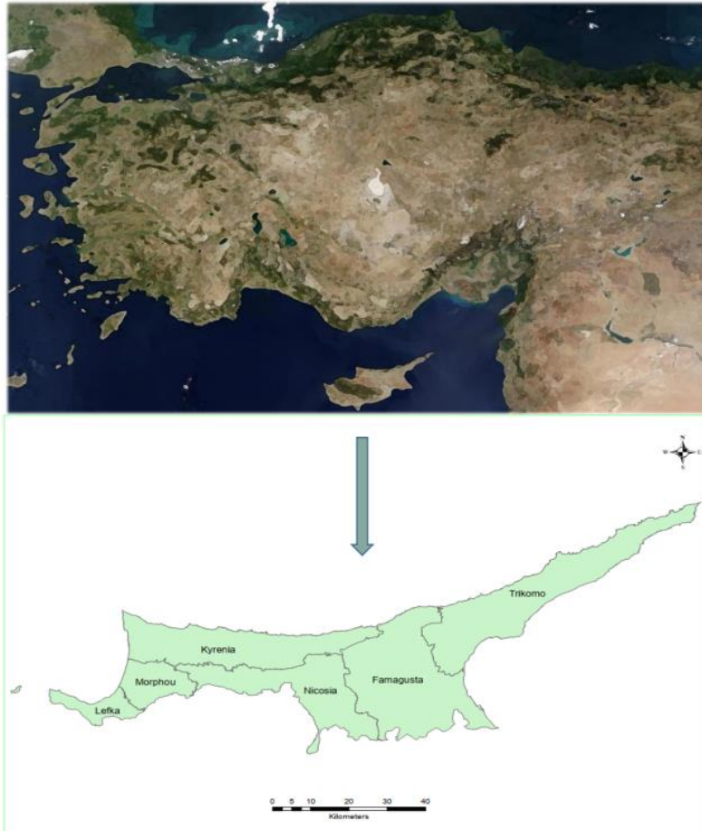
Fig. 1. Study area: Turkish Republic of Northern Cyprus and its cities