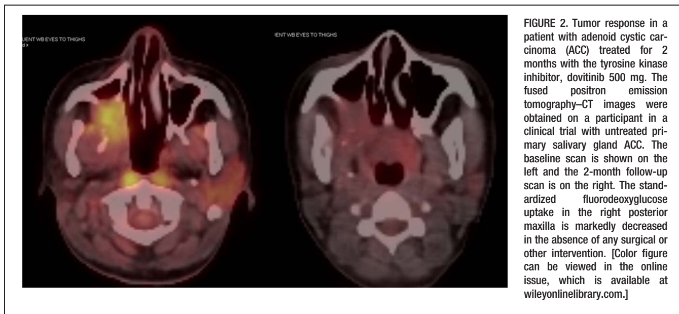
FIGURE 2. Tumor response in a patient with adenoid cystic carcinoma (ACC) treated for 2 months with the tyrosine kinase inhibitor, dovitinib 500 mg. The fused positron emission tomography–CT images were obtained on a participant in a clinical trial with untreated primary salivary gland ACC. The baseline scan is shown on the left and the 2-month follow-up scan is on the right. The standardized fluorodeoxyglucose uptake in the right posterior maxilla is markedly decreased in the absence of any surgical or other intervention. [Color figure can be viewed in the online issue, which is available at wileyonlinelibrary.com .]

including what may be an ACC-specific deletion of chromosome 1p35–36. Other frequent deletions are located at 6q24, 12q, and 14q. 23–25 However, the most intriguing alteration is a translocation between chromosomes 6q and 9p [(6;9)(q22–23;p23–24)]. Persson et al 27,28 were the first to report that this rearrangement juxtaposes the genes for the MYB and nuclear factor I/B (NFIB) transcription factors. This translocation seems to be specific for ACC, found in up to 86% of these tumors, 24,27,28 and may be helpful in differentiating these tumors from other forms of carcinoma, such as pleomorphic adenoma. 29,30 One consequence of the rearrangement is the overexpression of a fusion transcript (perhaps related to absence of a 3' negative regulatory element found in the normal MYB mRNA) as well as a largely intact MYB oncoprotein. This leads to deregulation of expression of the MYB target genes, which, in turn, promotes tumorigenesis. 28,31–33 Alterations of NFIB may also be of significance because mutations that seem to target this gene have been described in some ACCs. 24