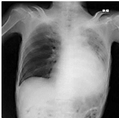
Fig. 1. Thoracic radiography showed cardiomegaly, and computed tomography revealed a left lung mass with invasion of the heart and pleural effusion.