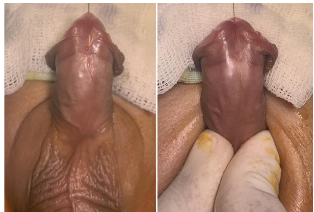
Figure 3 “Spongiosal plate” and “urethral plate” in distal penile hypospadias. The left photo shows the narrow glistening urothelial sheet overlying the interbulbar commissure “ie, urethral plate”. The right photo shows the augmented silhouette of the spongiosal plate from its bifurcation to its destination achieved by modest compression at the penile root. It favorably seemed not-linked to the poor condition of the “urethral plate” in both width and depth.

Adequate exposure of the corpus spongiosum was planned at operative dissection, from its bifurcation to its termination at the natural glanular ventral meatal