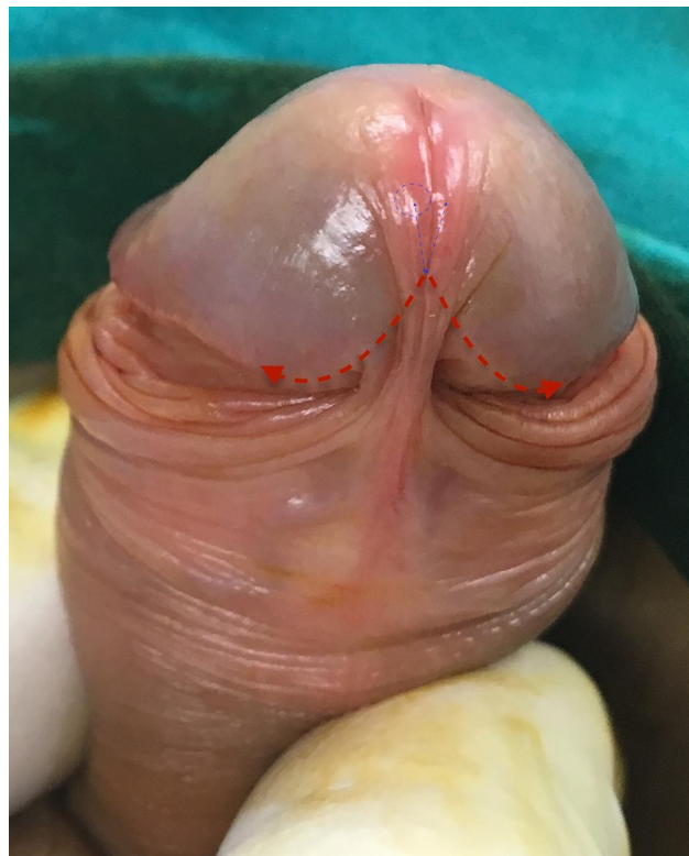
Figure 1 Topographic mapping of the meatal marks and glans wings among the control cohort. The blue dotted line represents the converging alignment of the glans wings in-between the side protrusions and ventral endpoint of the meatus. The red dotted arrows represent the diverging glans wings alignments over the ventrolateral aspect of the corpus spongiosum.