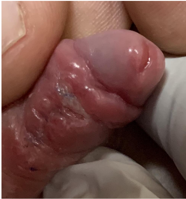
Figure 5 Early postoperative skin infection and partial dehiscence.

a fully epithelialized neourethra (after has been boosted with local skin flaps or grafts) or by relying solely on the plate for the reconstruction of an incompletely epithelialized neourethra, hoping for secondary healing with minimal scarring. 10,11