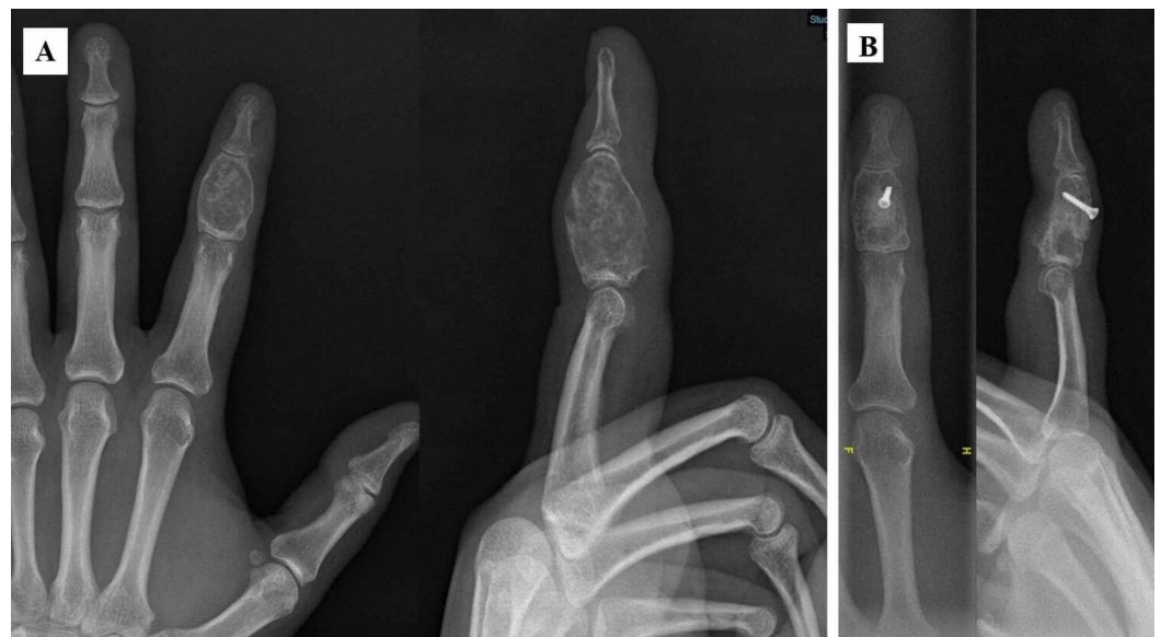
FIGURE 2: A: 32-year-old patient with giant enchondroma at the middle phalanx. B: Bone graft from iliac crest was fixed with a screw and was well incorporated at 12th month postoperatively.

There were no major complications, such as preoperative neurovascular or tendon injuries and postoperative fracture, observed in any of the patients. Postoperative finger joint stiffness was detected in five patients at the final follow-up. Four out of these five patients already had preoperative stiffness; three out of these five patients had an active range of motion (<80%) in comparison with the contralateral side and the other two patients had an active range of motion (>80%) in comparison with the contralateral side. A second surgery, such as tenolysis, was not performed in any patient as they had grip strengths of \geq 80\% in comparison with the contralateral side and did not accept a second operation. One patient complained of swelling in the middle phalanx at the 12-month postoperative follow-up; however, this patient had preoperative swelling (giant enchondroma, Figure 2).