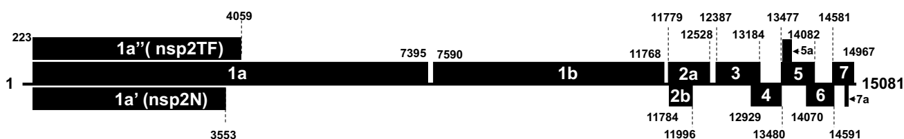
Fig. 1 Schematic illustration of the genomic structure of the PRRSV1 strain HUN60077/16

To confirm this hypothesis, we utilized the algorithms (RDP37, GENECONV38, MaxChi39, BootsCan/RecScan39, SiScan40, and 3Seq41) implemented in software RDP4 [14]. In addition, a sliding-window analysis tool, SimPlot, was