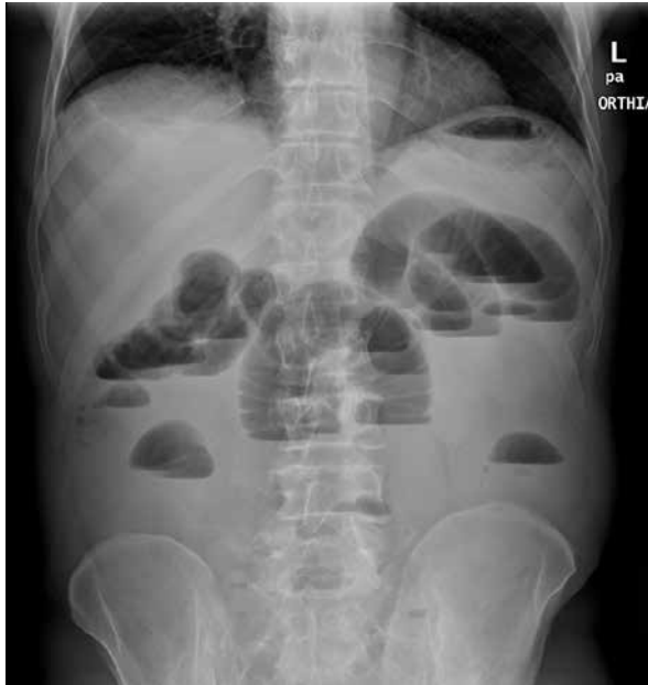
Figure 1. X-ray image with air-fluid levels and distension of the bowel loops