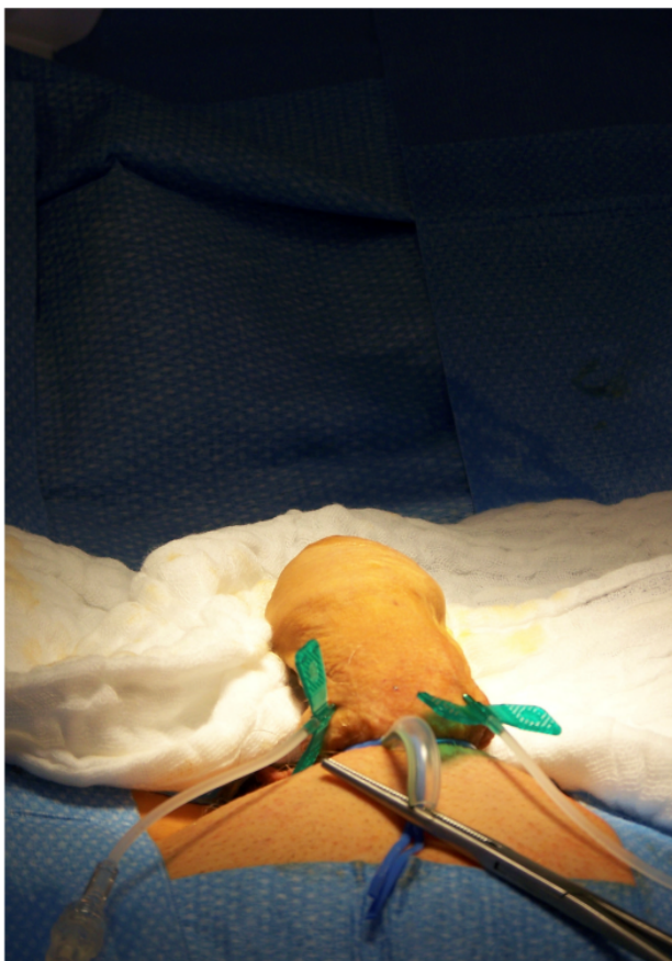
Figure 2: Intraoperative artificial penile erection

placed in all patients. Elastic bandages were applied in all patients postoperatively in addition with bed rest, penoscrotal elevation and prophylactic antibiotics.