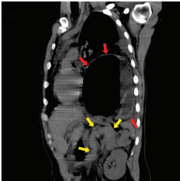
Figure 1. Axial CT image indicated intrathoracic stomach herniation through the left diaphragmatic defect (red arrows), meanwhile, bulky and folded into a “Ω” shaped pancreas closed to the diaphragmatic defect (yellow arrows). CT = computerized tomography.

The founding of this case demonstrates a rare anatomical abnormality that may have been the cause of AP. Therefore, it is important that prior to such cases being labeled as “idiopathic,” clinicians need to be vigilant, to maintain a high index of suspicion for the diaphragmatic injuries, whether they are immediately after the trauma or even decades after the trauma. In