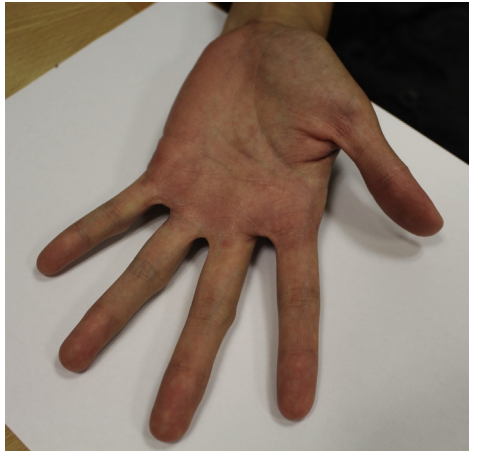
Fig 4. Resolution of pustular lesions 2 weeks after initiation of terbinafine.

reported exposures include an elephant<sup>10</sup> and direct human-to-human contact by kissing.<sup>3</sup> Immunosuppression use in our patient likely predisposed her to infection after contact with the hedgehog.