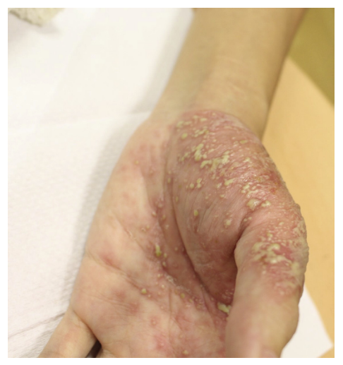
Fig 2. Small lakes of pustules over the left palm.

T erinacei ATCC 28443 on the National Institutes of Health database.<sup>9</sup>