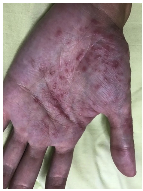
Fig 1. Small erythematous papules and pustules over the left palm.