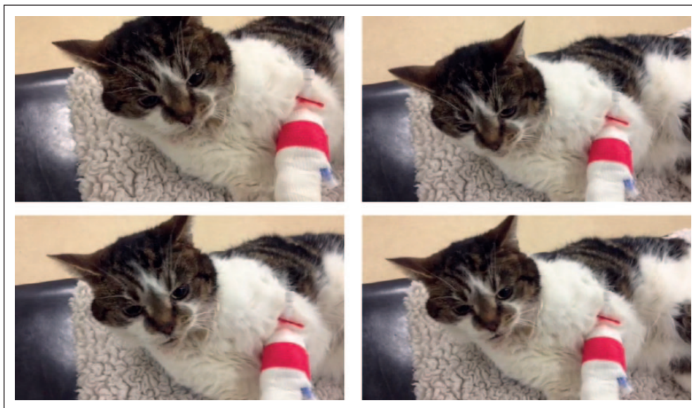
Figure 2 Focal seizure demonstrating the cat's facial twitching (see also Video 1 in the Supplementary material)

marked head pressing, persisted but did not deteriorate further over the following 24 h. The respiratory rate increased overnight and respiratory effort had markedly increased. Therefore, an exploratory laparotomy was performed to address the chronic diaphragmatic rupture on the second day following admission. It was suspected that the clinical signs of the cat were due to hepatic encephalopathy (HE) from multiple acquired portosystemic shunts (MAPSS) secondary to portal hypertension.