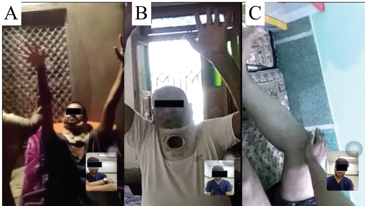
Fig. 3 Teleconsultation video calls in spine follow-up. (A) Examination of craniocervical junction patient with the help of a relative. (B) Examination of postoperative patient of cervical laminectomy for cervical canal stenosis due to ossified posterior longitudinal ligament. (C) Examination of motor power with the help of a relative in a patient who had undergone dorsal laminectomy for hypertrophied ligament flavum.

educated up to primary school, or had a professional degree, respectively. Patients with degenerative disease (80.53%) and CVJ surgery (73.91%) were associated with the lowest success rate, which was not significant. All TCs were done using WhatsApp messenger (WhatsApp LLC, California, United States) video calling platform. All TCs were done by single resident doctor in the department of neurosurgery and it was supervised by a faculty member.