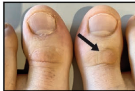
Figure 2. Knuckle Pad (black arrow) on the right big toe partially refractory to the keratolytic treatment. The Knuckle Pad that was originally present on the left big toe completely disappeared after treatment.