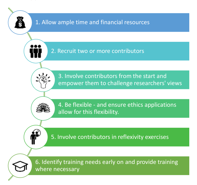
FIGURE 3 Recommendations