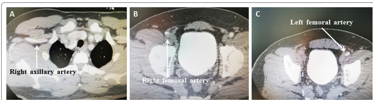
Fig. 1 Acute type A aortic dissection with involvement of the right axillary artery (A), right femoral artery (B), and left femoral artery (C)