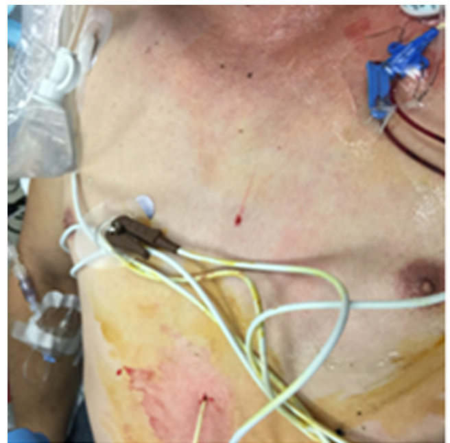
Fig. 3. Central venous catheter inserted for pericardiocentesis.