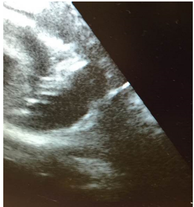
Fig. 2. A bedside ultrasound demonstrating a pericardial effusion.

A decision was made immediately to take the patient to the operating room. Within the trauma bay, a pericardiocentesis was performed with aspiration of 100 cc of blood yielding a transient decrease in tachycardia and concomitant increase in blood pressure, as well as improved ventricular contractility on bedside echocardiogram. As a temporizing measure to provide further drainage, a central venous catheter was placed into the pericardium which drained an additional 100 cc of blood upon repeated aspiration (Fig. 3). Resuscitation with blood products was ongoing as the patient was taken emergently to the operating room. A left anterolateral thoracotomy was performed after which longitudinal pericardotomy provided immediate relief of tamponade. The nail was removed from the right atrium after which a brief period of cardiac arrest (5 s) was relieved by open cardiac massage. A 1 cm laceration of the right atrium was repaired with interrupted pledgeted #1 Ethibond suture. A 32 French chest tube was left in the left pleural cavity, and the chest was closed. In total, the patient received four units of packed red blood cells, four units of fresh frozen plasma and four liters of lactated ringers solution. Post-operatively, the patient was extubated and his chest tube was removed. He made an uneventful recovery and was discharged home.