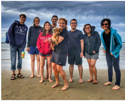
2018 lab retreat.

love discovering how the immune response is orchestrated over space and time (Calabro et al., 2016b). This can be a difficult process, as “novelty” is often not considered the defining feature of this line of investigation as it would be for identifying a brand new cell type or function; however, silos of novel information require context in order to move our understanding of immunity forward. Figuring out how puzzle pieces fit together can be just as rewarding as discovering a new puzzle piece. Discovering the bigger picture of how cells and systems are connected often involves finding a missing piece of information or redefining the role of a partially understood molecule or cell, but then it requires some “out-of-the