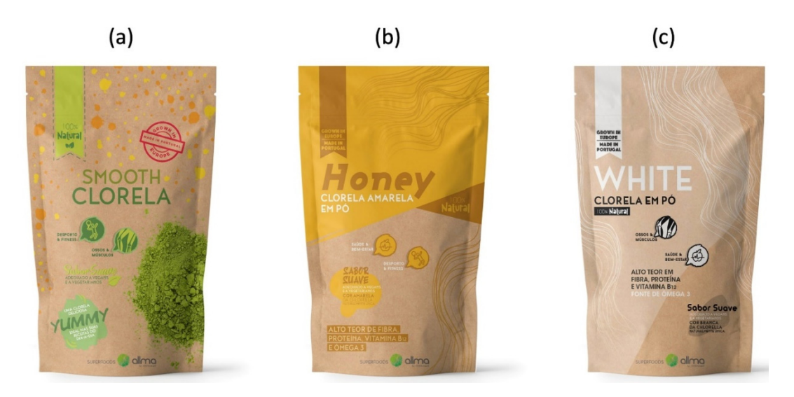
Figure 1. Commercial Chlorella produced by the Portuguese company Allmicroalgae: ( a ) lime, ( b ) yellow, and ( c ) white.

An important factor to consider in the application of microalgae biomass for food is the digestibility, as the robust cell wall of certain strains can restrict the access of the digestive enzymes to the cell components [105]. Niccolai et al. [106] investigated the digestibility of 12 microalgae using pepsin and pancreatin as enzymes. The authors found the highest digestibility for cyanobacteria, mainly A. platensis F&E-C256 (78% dry matter, 86% organic matter, 79% carbohydrate, and 82% crude protein digestibility), Chlorella sorokiniana F&E-M-M49 and C. vulgaris Allma. Marine species, such as Tetraselmis suecica , Phaeodactylum tricornutum , Nannochloropsis sp., and Porphyridium purpureum , were the least digestible [106]. This is probably due to different cell wall structures. Nannochloropsis has a thick cell wall composed of cellulose and algaenans that may reduce digestibility. Porphyridium cells are covered by polysaccharides that can form stable complexes with proteins and reduce cell access to proteolytic enzymes. On the other hand, green algae such as T. suecica have a cell wall composed of cellulose, hemicellulose, pectic compounds, and glycoproteins that can interfere with the action of digestive enzymes. Additional treatments on microalgal biomass could be performed for increasing protein digestibility.