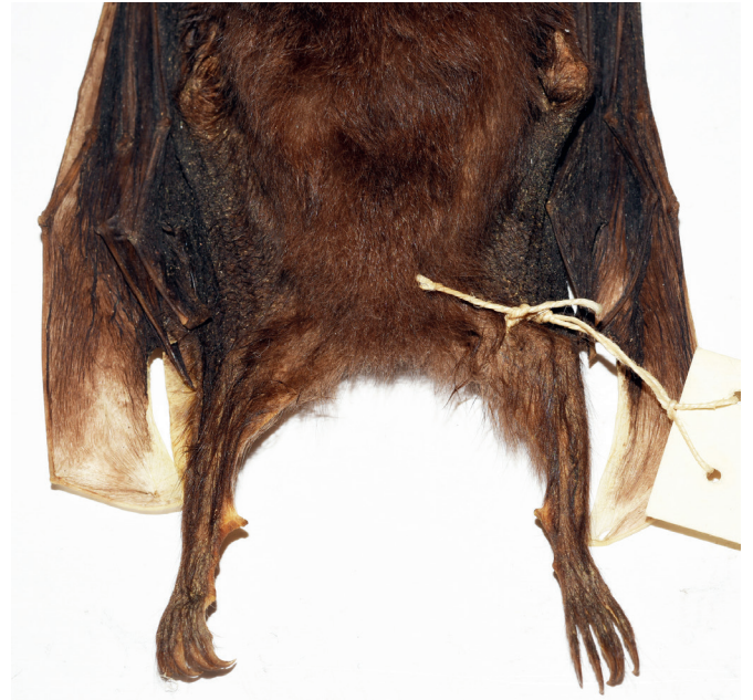
Fig. 140.10 Hairy-legged vampire bat ( Diphylla ecaudata ) in Peru, showing its distinctive feature.

The three species of true vampire bats (Desmodontinae) must be distinguished from non-hematophagous species that have been named “vampires,” such as the spectral vampire bat ( Vampyrus spectrum —Phyllostomidae [Fig. 140.9]—the largest bat of the New World), and the false vampire bats (Megadermatidae) of Africa, Asia, and Australia. The common vampire ( Desmodus rotundus [see Figs. 140.6, 140.7, and 140.8]), hairy-legged vampire ( Diphylla ecaudata [Fig. 140.10]), and white-winged vampire ( Diaemus youngi ) are confined to Central and South America (Fig. 140.11). Vampire bats feed at night on the blood of vertebrates (Figs. 140.12 and 140.13): mammals, birds, and reptiles. Diaemus and Diphylla feed largely on birds but occasionally on humans, whereas Desmodus prefers mammals, especially large domestic herbivores. Self-sharpening incisor and canine teeth are modified to allow painless venesection. The vampire's saliva flows down a groove on the dorsal surface of its tongue into the wound. Salivary toxins increase capillary permeability, inhibit platelet aggregation, inhibit activated