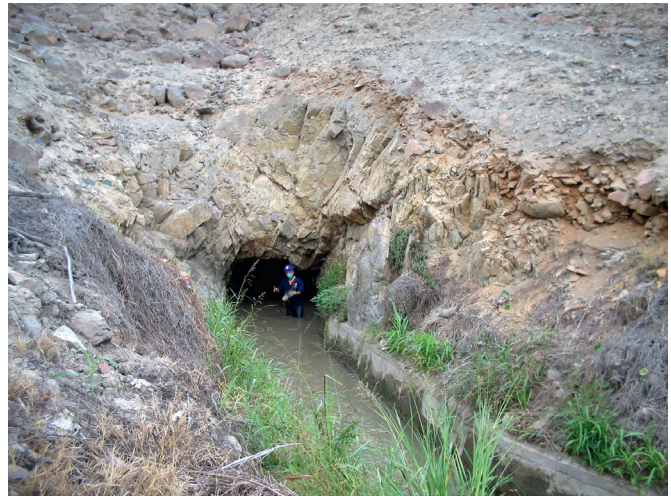
Fig. 140.15 Irrigation drain used as a roost for vampire bats in Peru.

communities of protective lighting, have led to small epidemics of human rabies transmitted by vampire bats. These have accounted for more than 500 deaths since 1975, usually affecting rural communities of indigenous Amerindians, such as the Warao in northeast Venezuela. There have been recent outbreaks in Colombia (Chocó, Santander) and Peru (Condorcanqui, Bagna, Puerto Maldonado, Ayacucho, and in 2016–2017, 85 human cases in Cuzco District), Brazil (Para, Maranhão), and Venezuela (Delta Amacuro). Humans are bitten at night on their extremities, ears, and faces. Children appear particularly vulnerable. They may not wake up but discover bleeding wounds showing a double puncture made by the incisors or a depressed lesion with a raised edge (Figs. 140.16 and 140.17) in the morning. Mosquito nets are normally protective, but accessible body parts may be attacked, and the vampire bat's melena stool may be found staining the net (Fig. 140.18). Historical epidemics of vampire bat rabies, like the Trinidad cases, were characterized by predominantly paralytic disease, but a minority of patients develop hydrophobia and other features of furious rabies. Vampire bat–related strains of classic Species 1 rabies virus