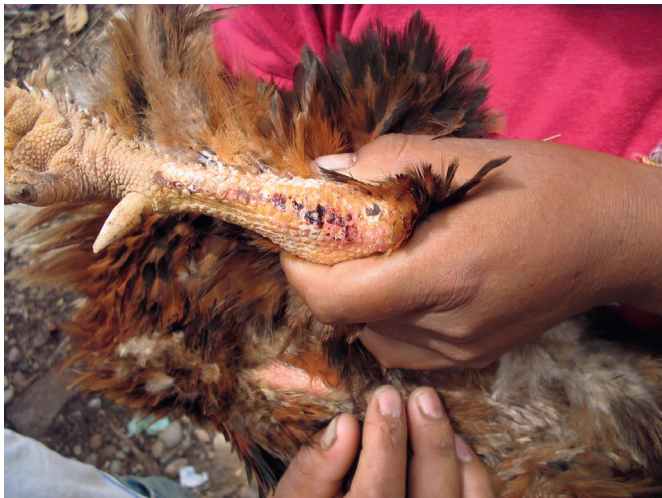
Fig. 140.13 Bite sites of vampire bats on a chicken in Peru.