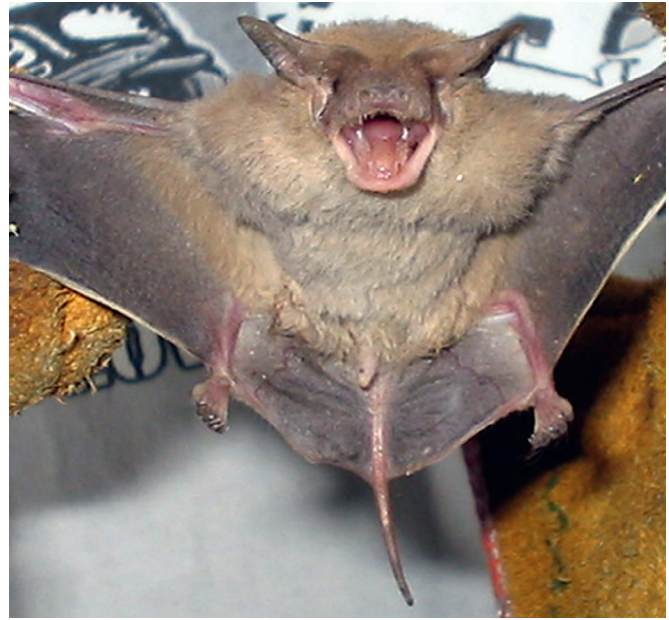
Fig. 140.3 Mexican free-tailed bat ( Tadarida brasiliensis —Molossidae) in Peru.

In the Americas, this virus has been found in bats of the families Molossidae, Phyllostomidae [both in true vampire bats, Desmodontinae, and in non-vampire bats, such as Seba's short-tailed leaf-nosed bat ( Carollia perspicillata ; see Fig. 140.5)] and Vespertilionidae. It has been transmitted to humans by members of these