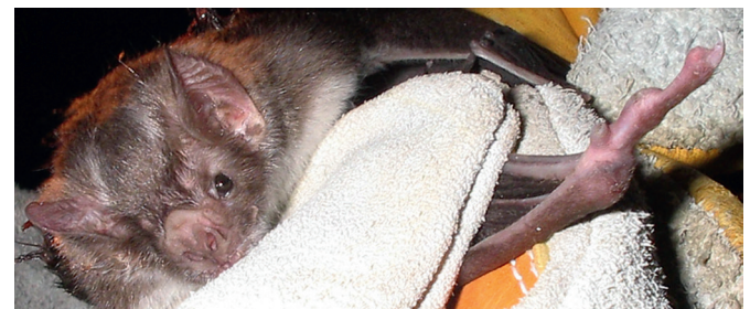
Fig. 140.8 Common vampire bat ( Desmodus robustus —Desmodontina) showing the enlarged thumb enabling quadrupedal gait.