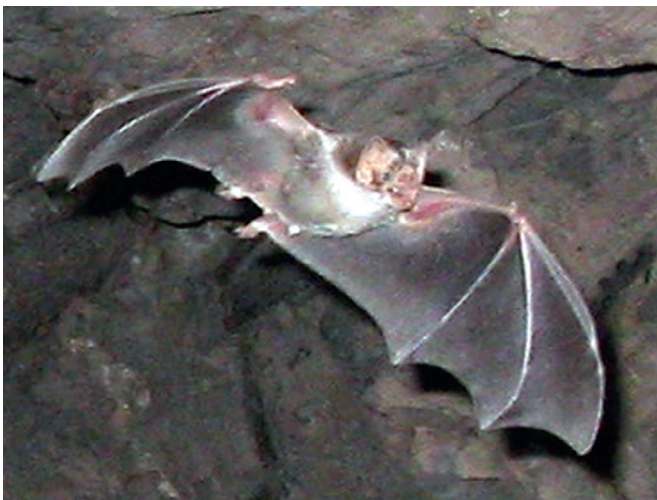
Fig. 140.6 Common vampire bat ( Desmodus robustus —Desmodontina) flying in a cave roost in Peru.