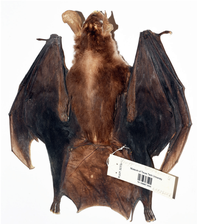
Fig. 140.9 False vampire or spectral bat ( Vampyrus spectrum ) in Peru.

East, closely related to Irkut), West Caucasian bat virus (Krasnodar region, North Caucasus in common bent-winged bat [ Miniopterus schreibersi ]), Ikoma lyssavirus (Tanzania in a civet cat not a bat), Bokeloh bat lyssavirus (Germany and France in Natterer's bats, [ Myotis nattereri ]), Gannoruwa Sri Lankan bat lyssavirus, Taiwan bat lyssavirus, Kotalahti (Finnish) bat lyssavirus, and Lleida (Spanish) bat lyssavirus.