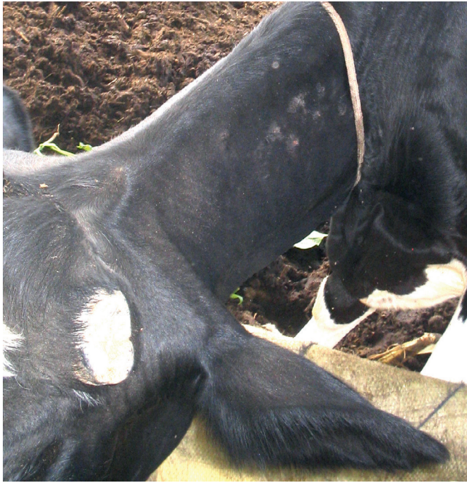
Fig. 140.12 Bite sites of vampire bats on a cow in Peru.