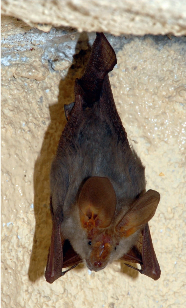
Fig. 140.4 Hairy slit-faced bat ( Nycteris hispida —Nycteridae), Tsavo National Park, Kenya.