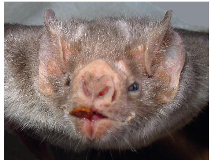
Fig. 140.7 Common vampire bat ( Desmodus robustus —Desmodontina) showing cleft in lower lip for sucking up the blood meal.