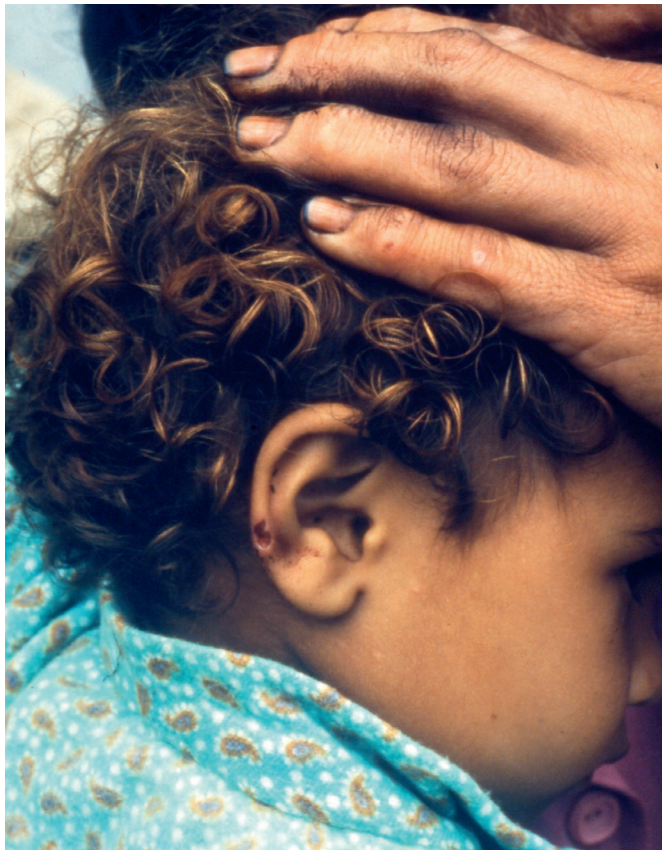
Fig. 140.17 Bite inflicted by a vampire bat in Tapirai, São Paulo State, Brazil.

have been found in many South American wild and domestic mammals and have been transmitted to humans, for example, by pet marmosets in northeast Brazil.