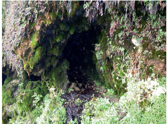
Fig. 140.14 Natural cave roost for vampire bats in Peru.

Rabies (classic Species 1) is enzootic in many, but not all, vampire bat populations. Since the late 14th century, European explorers of the Caribbean and South America reported the association between vampire bat attacks and fatal human illness. From 1925 to 1936, there was an epizootic of vampire bat rabies in Trinidad, with 2000 fatalities in cattle and horses and 53 human deaths from the paralytic form of rabies. Initially, it was misdiagnosed as oleander poisoning, bulbar paralysis, botulism, or grass disease in the animals and poliomyelitis in the patients. Ecologic changes, such as destruction of forest and introduction of cattle ranching, construction of trans-Amazonian highways, the invasion of newly accessible jungle by gold miners, and electric power failures that deprived jungle