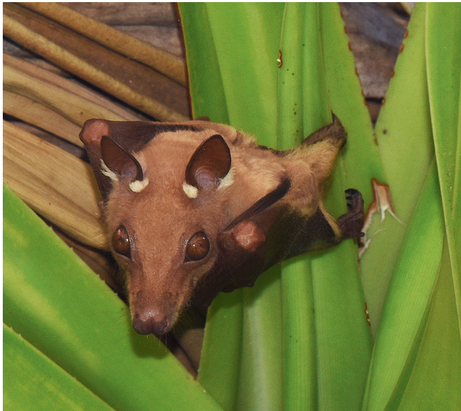
Fig. 140.2 Epauletted fruit bat ( Epomorphus spp.—Pteropodidae), Kenya coast.

leaf-nosed bats (Phyllostomidae) (Fig. 140.5)—containing the true vampire bats (subfamily Desmodontinae) (Figs. 140.6, 140.7, and 140.8)—and evening bats (Vespertilionidae).