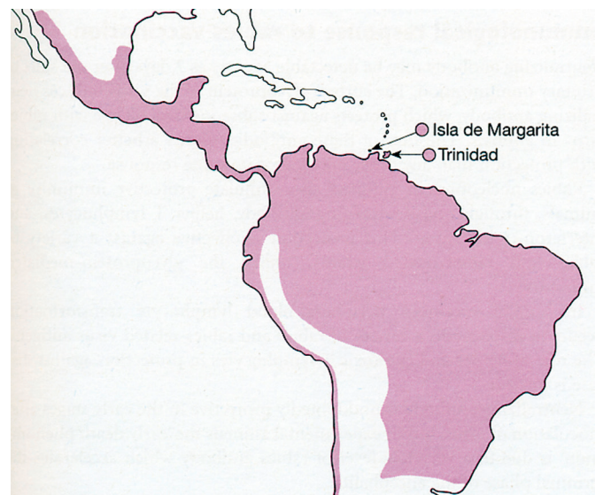
Fig. 140.11 World distribution of vampire bats (© David A. Warrell).

factors X and IX (“draculin”), and activate plasminogen (“desmoteplase”—currently being developed as a thrombolytic drug, DSPA-alpha-1).