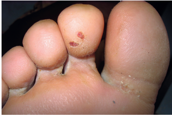
Fig. 140.16 Bite inflicted by a vampire bat in Puerto Maldonado, Peru.