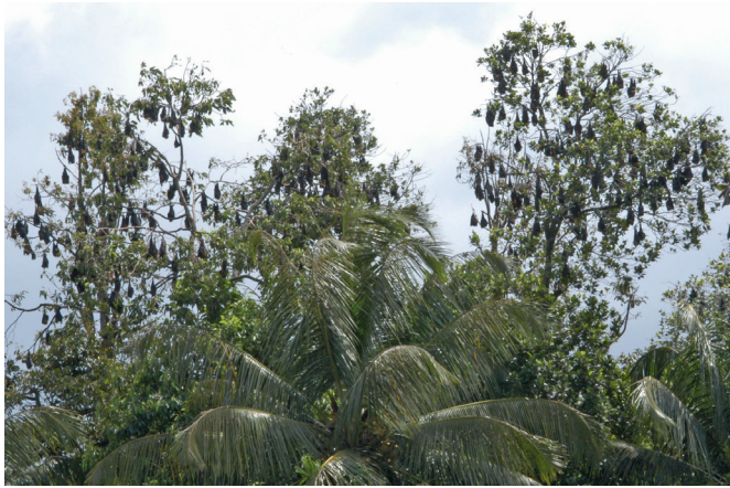
Fig. 140.1 Indian fruit bats ( Pteropus giganteus —Pteropodidae) roosting at Mawanella, Sri Lanka.