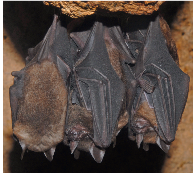
Fig. 140.5 Seba's short-tailed bat ( Carollia perspicillata —Phyllostomidae).