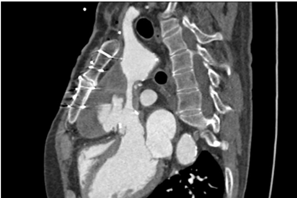
Fig. 1. A preoperative enhanced computed tomography image shows a contained rupture of the ascending aorta with pseudoaneurysm formation.