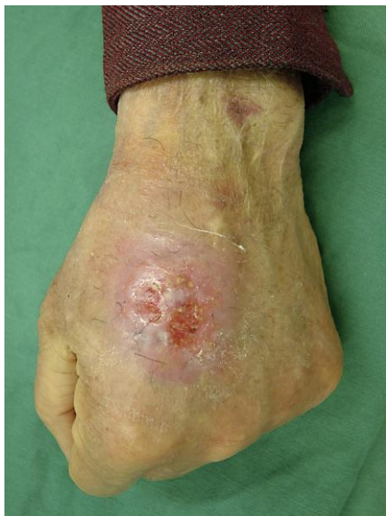
Fig. 1. Plaque with ulcer on the left hand.