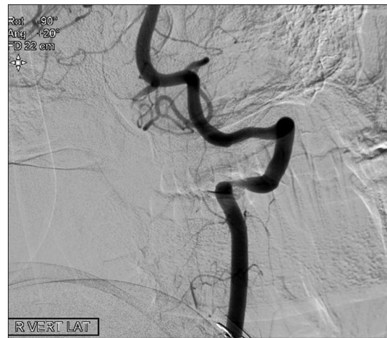
Figure 2: In dynamic digital subtraction angiography imaging, when the head is rotated to the left side, near-complete occlusion was observed at the right vertebral artery at C1–C2 levels

of the VA could be the result of atlantoaxial instability, tension in the paravertebral muscles, severe spondylolysis, and calcification or hypertrophy of the atlanto-occipital membrane. [3-5] Stenosis of the VA in BHS is most commonly seen at the level of C1–C2, with C6 being the second most common level. [4] Fibrous bands and formation of osteophytes at level C6 could cause VA stenosis. [6]