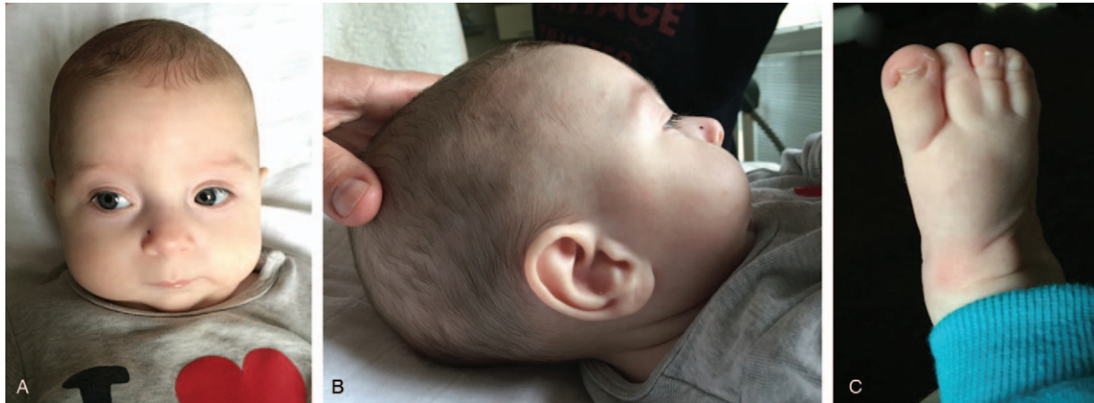
Figure 1. Some of the patient's external phenotypic features associated with PVNH7 around 5 months of age: (A) frontal and (B) lateral view of the head with visible microretrognathia; (C) 2nd and 3rd toe syndactyly.

bottom-up strategy based on the identification and listing of all the proband's variants evidenced by ClinVar as pathogenic and likely pathogenic with subsequent manual searching for those consistent with proband's clinical manifestations, population data, and segregation patterns of the suspected variants and the partial phenotypes in the family. None of these analyses was performed due to research and all presented findings were results of the routine process of molecular diagnostics, therefore no ethics committee approval was needed.