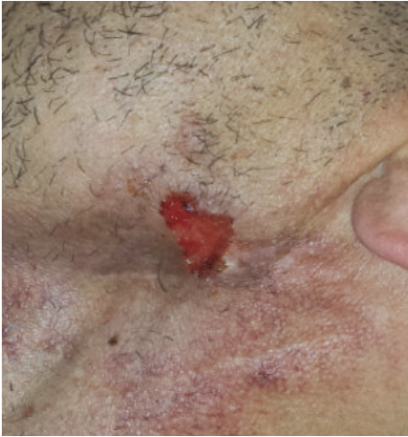
FIGURE 1: Prurigo nodularis. A 20x10mm lesion at the site of previous radiation therapy near the mandible.