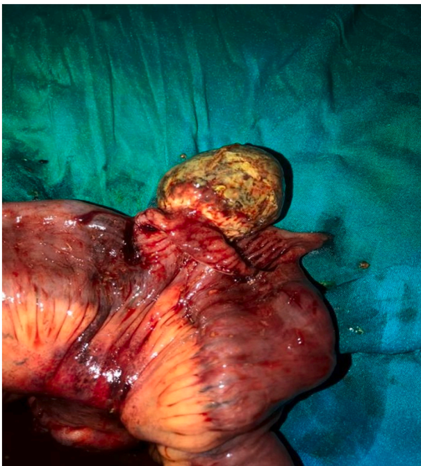
Fig. 3. (A) Showing the ileo-ileal intussusception before manual reduction. (B) Showing the second intussusception after manual reduction.

Moreover, most of these tumors are positive for CD34 [10,11].