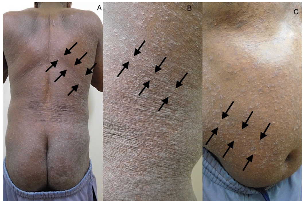
FIGURE 1: Scabies surrepticius: scabies mimicking pityriasis rosea.

examination revealed burrows on his finger webs (Figure 2). Separate mineral oil preparations of the skin scrapings taken from several areas including his chest, finger webs, and umbilicus, each showed mites, ova, and scybala (Figure 3).