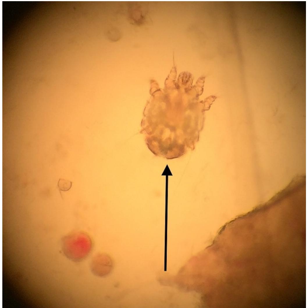
FIGURE 3: Sarcoptes scabiei mite.

The examination of the mineral oil preparation of the skin lesion scrapings using a light microscope shows a Sarcoptes scabiei mite (indicated by the arrow).