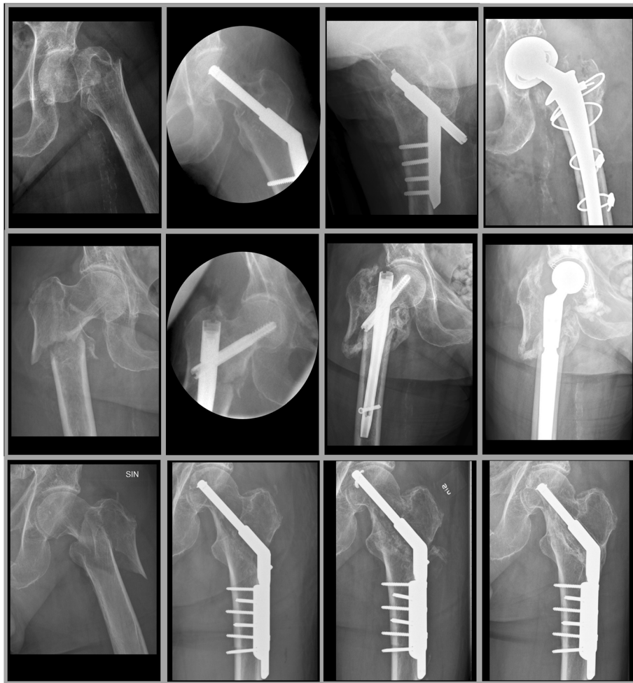
Fig. 3 From left to right preoperative, intra/postoperative, post technical complication and final radiographs of the typical and most frequent type of technical complication that occurred with dynamic hip screw (medialisation and nonunion followed by hip joint replacement, upper panels), intramedullary nail (nonunion followed by hip joint replacement, middle panels) and uniaxial Medoff sliding plate (Twin hook penetration followed by Twin hook replacement and fracture healing, lower panels)

cut-out may occur following loss of fixation purchase in the femoral head and neck fragment [13, 18]. If purchase is maintained, nonunion, implant breakage or femoral shaft stress fracture may occur due to persistent unloading of the fracture surfaces [19–22], typical complications that were all observed in the present study.