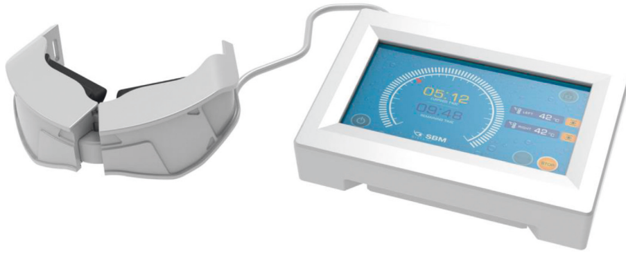
FIGURE 1: The eye mask Activa (SBS Sistemi, Turin, Italy).