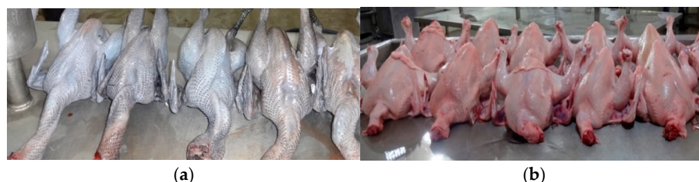
Figure 1. Dressed carcasses of Kadaknath (a) and broiler (b) chickens.

Data bearing different uppercase superscripts row wise and figures bearing different lowercase superscript column wise (under each trait) differ significantly.