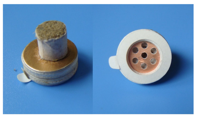
Fig. 3 Stick-on moxa cone

In ISRCTN68475405, a stick-on moxa cone was used in the traditional moxibustion group patients (Fig. 3). The stick-on moxa cone consisted of a moxa cone (1.8 cm in diameter) and a cylindrical base (8 mm high). The patients were told to either lie on their backs or sit in a position that would leave both knee joints completely exposed. Three points (ST35 Dubi, EX-LE4 Neixiyan, and Ashi point) were stimulated bilaterally in the treatment. The moxa cones were ignited after being attached to the acupoints. When the patients felt burning at the skin, the moxa cone was removed and a new one would be attached and ignited again. All points received 3 cones in each session. Each patient received a total of 18 treatments over 6 weeks with 3 sessions a week, and the treatment was also given once every other day.