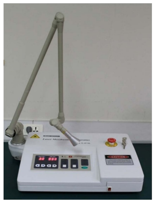
Fig. 2 SX10-C1 10.6-µm infrared laser moxibustion device

In ISRCTN68475405, a stick-on moxa cone was used in the traditional moxibustion group patients (Fig. 3). The stick-on moxa cone consisted of a moxa cone (1.8 cm in diameter) and a cylindrical base (8 mm high). The patients were told to either lie on their backs or sit in a position that would leave both knee joints completely exposed. Three points (ST35 Dubi, EX-LE4 Neixiyan, and Ashi point) were stimulated bilaterally in the treatment. The moxa cones were ignited after being attached to the acupoints. When the patients felt burning at the skin, the moxa cone was removed and a new one would be attached and ignited again. All points received 3 cones in each session. Each patient received a total of 18 treatments over 6 weeks with 3 sessions a week, and the treatment was also given once every other day.